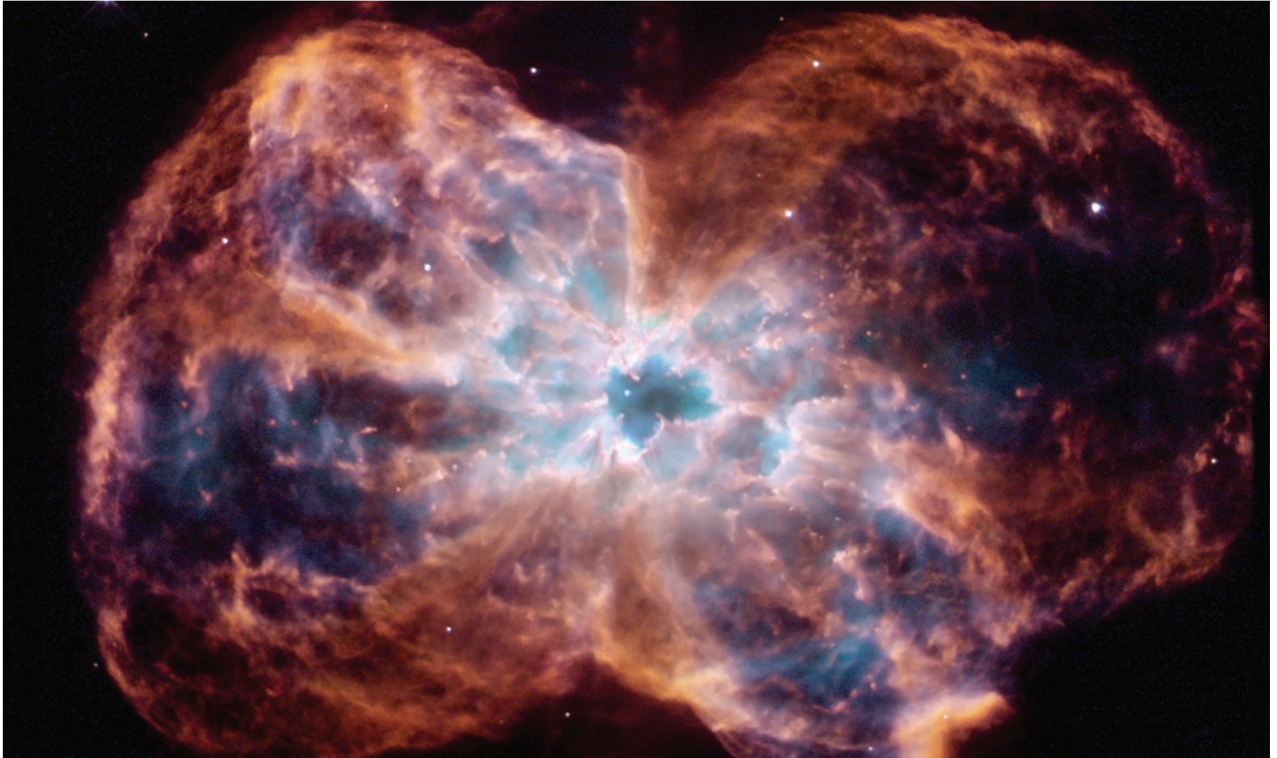
Planetary Nebula NGC 2440